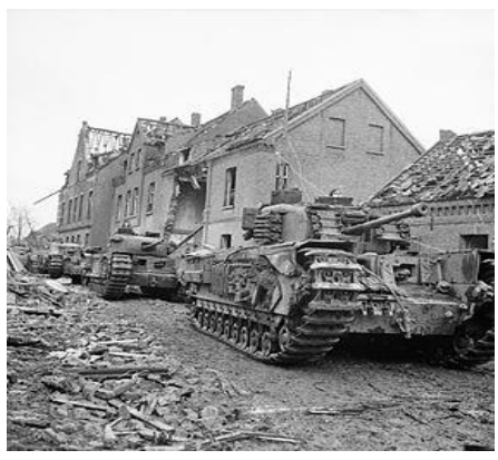
Churchill tanks in a destroyed street in Kleve - Germany

The Camerons were part of the second phase of Operation Blockbuster in the fight for Calcar Ridge, 26 February. All the objectives of the Battalion had been achieved but measures were taken against possible further German attacks. Around midday, the 6th Brigade had completed their task successfully, the first phase of Operation Blockbuster. This was very good for morale.